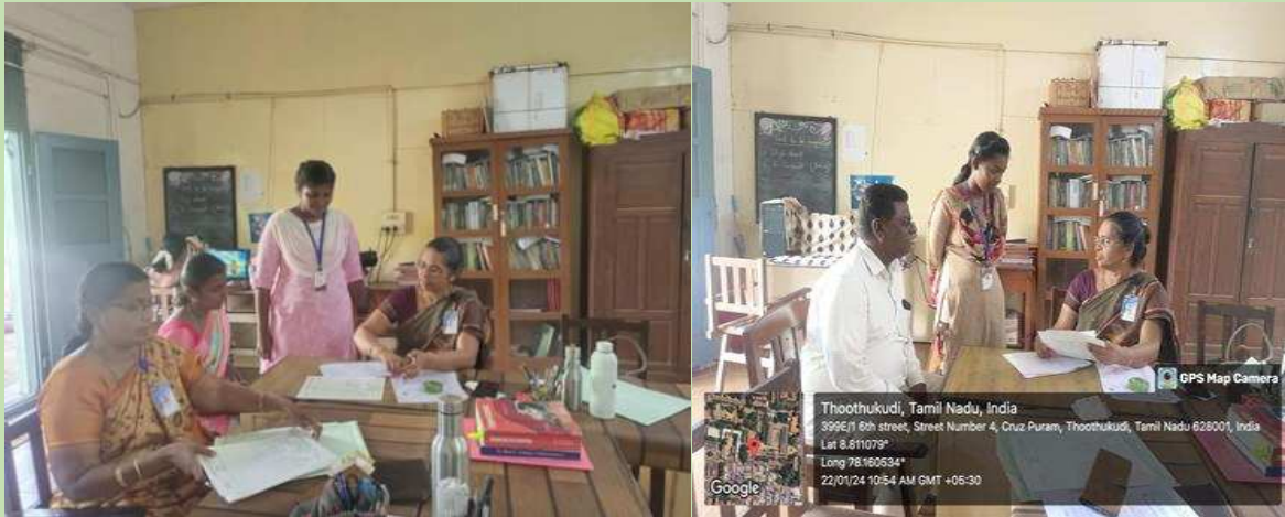
Strengthening Partnerships for Student Success: Parent-Teacher Association Meeting

Subsequently, End Semester Examination mark sheets were distributed to parents in their respective departments. This meeting served as a platform to review students' academic performance, discuss their needs and challenges, and implement necessary remedial measures.