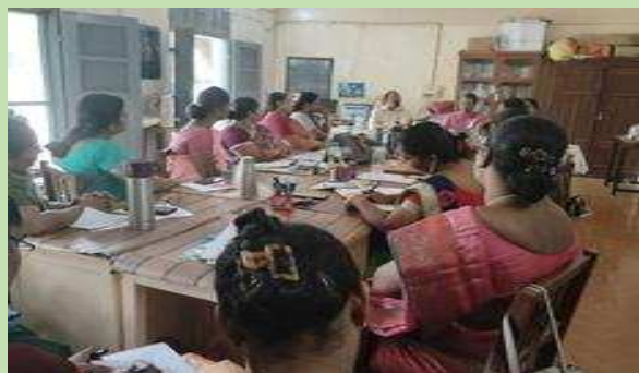
Academicians as Emphasizing Outcome-Based Education (OBE) and the Choice Credit System (CCS)

The Board of Studies Meeting for the academic year 2023-2024 was convened on 9 th March 2023