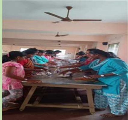
Joining Hands for Humanity