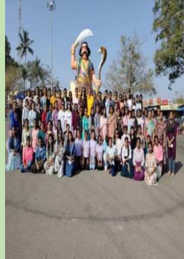
Exploring Karnataka: A Journey of Learning, Culture, and Memories