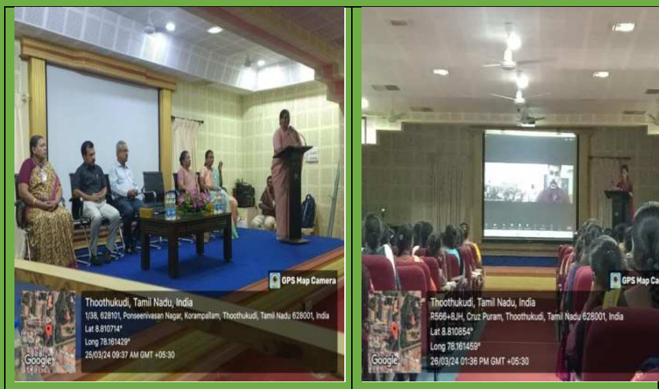
Biotechnology to Entrepreneurship