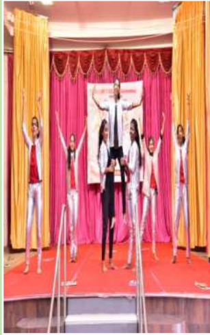
A celebration of Nostalgia and Unity

The Alumnae Meeting for the academic year 2023-24 was held on 13 th April 2024