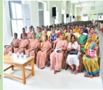
Honouring the past, Embracing the Bond